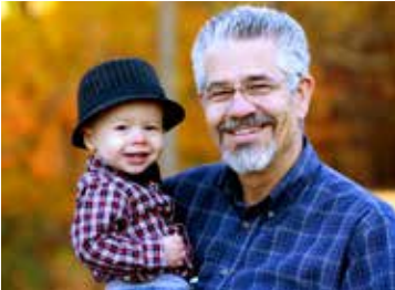
One of my 10 joys (grandchildren)